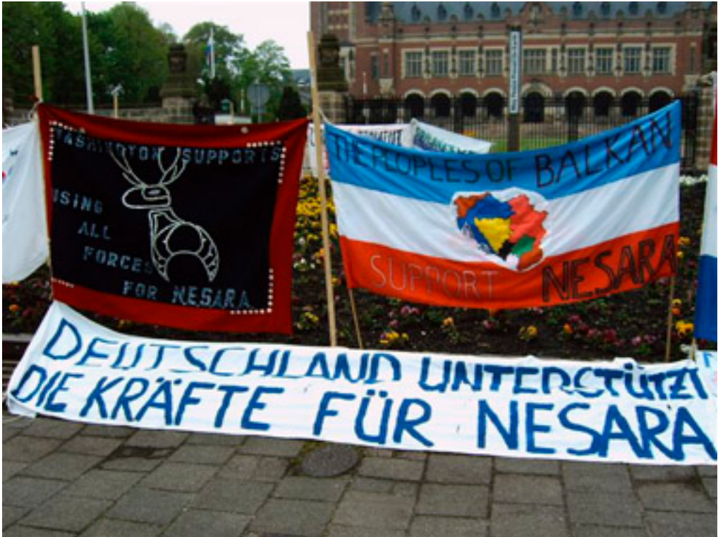
Washington, the Balkan and Deutschland for NESARA NOW!