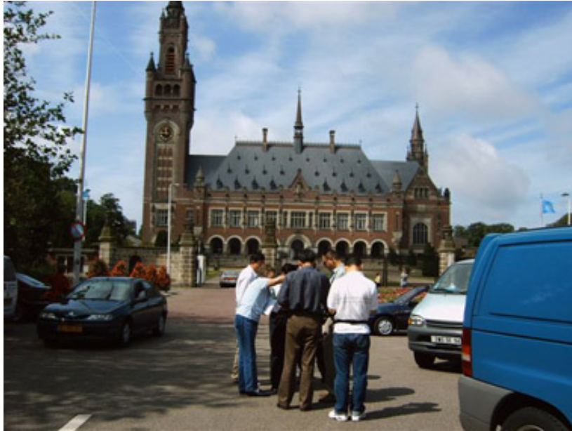
Miep handing out flyers to tourists.