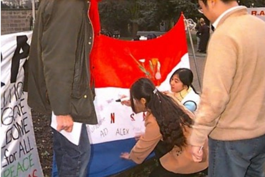
Chinese group signing their support for NESARA