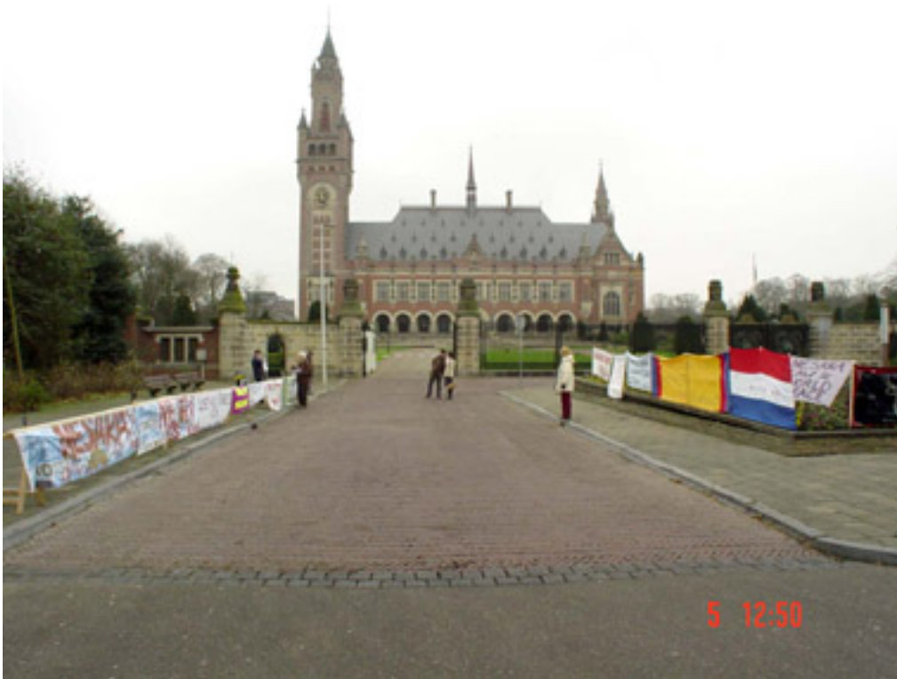
The road to the Peace Palace