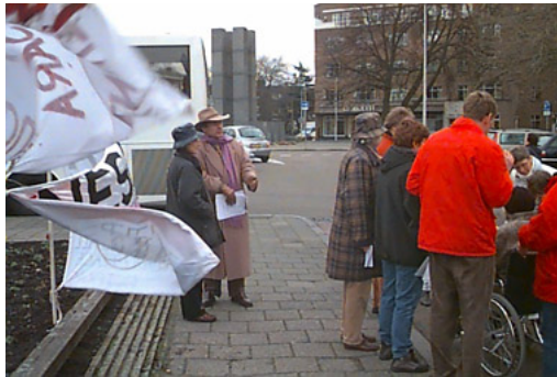
The wind was very strong today....a lot of sticks were broken soon after we started the demo.