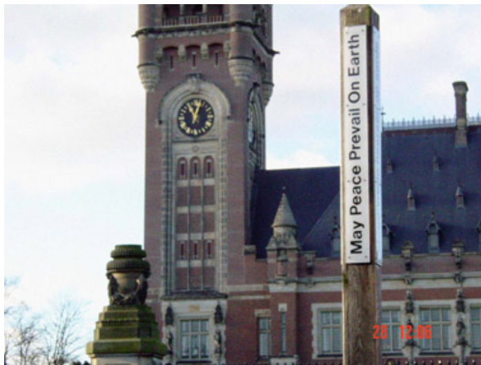
The United Nations World Court—or Peace Palace—in the Hague, Netherlands