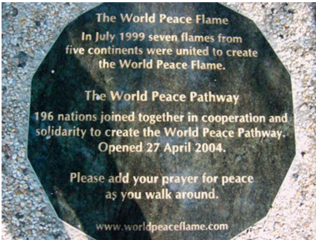
This is the plaque which is put at the beginning of the World Peace Pathway.