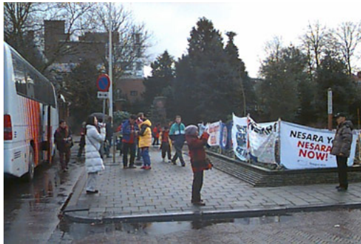
A bus with Asian people arrived...