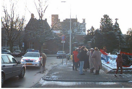
It was cold and windy