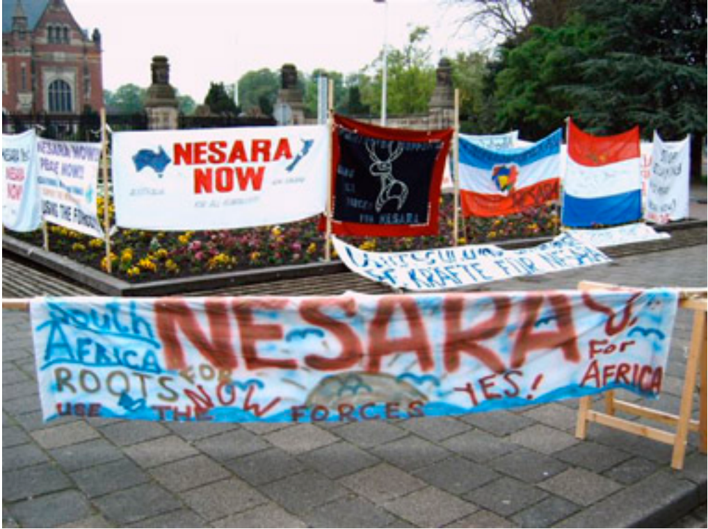
South Africa, Germany, Australia, New Zealand, Washington, the Balkan countries and the Netherlands for NESARA NOW!