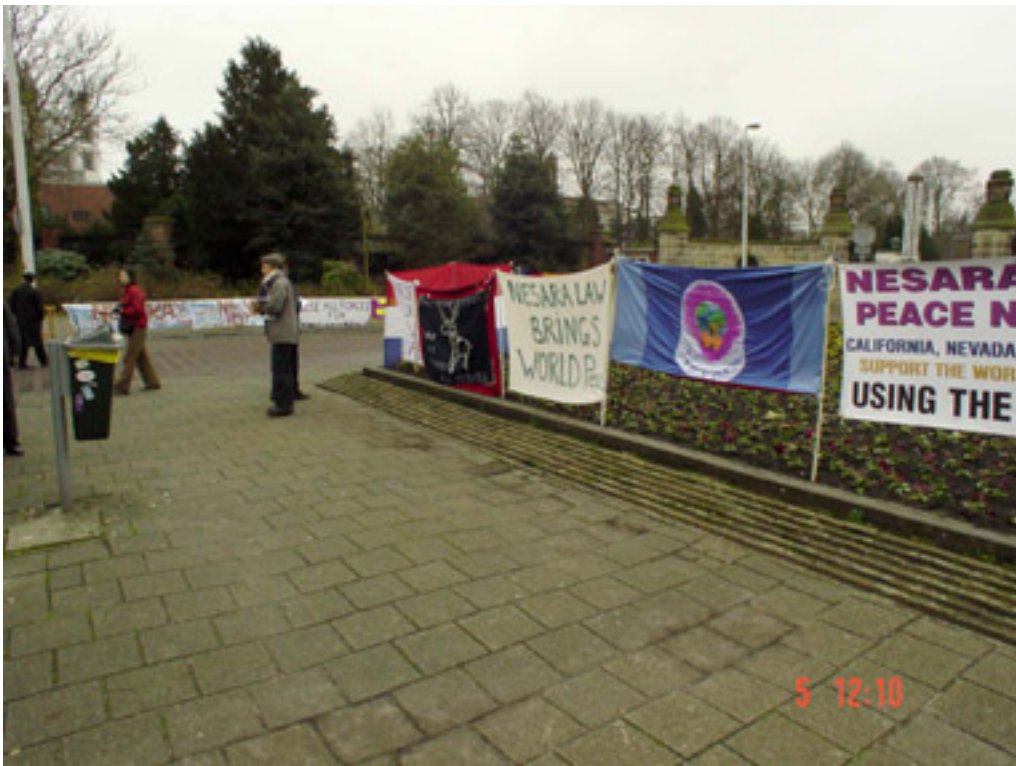
...the world wants peace...