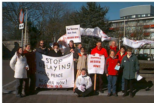
Group picture of people being present today.