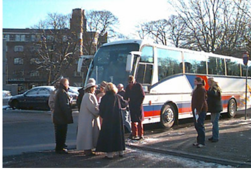
A bus with....(not Chinese (!) but) German tourists!!