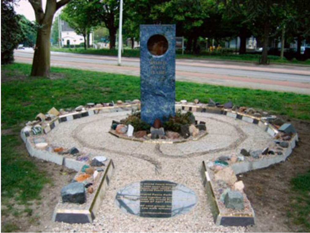
The World Peace Pathway.