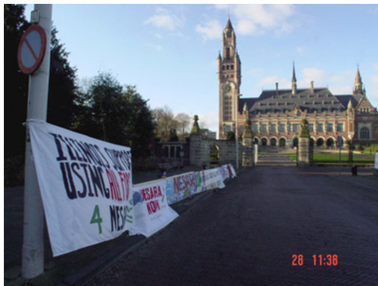
We had more banners than people present!