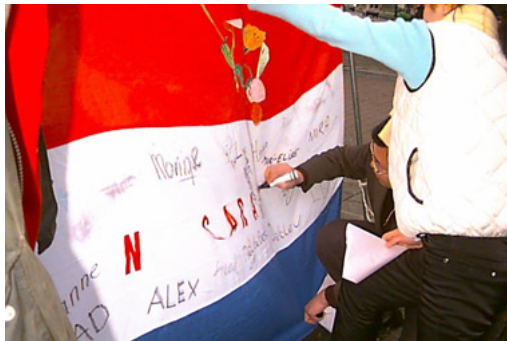
Chinese tourists putting their names on the Dutch flag image.