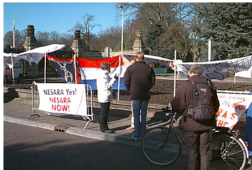
Nel telling people about NESARA